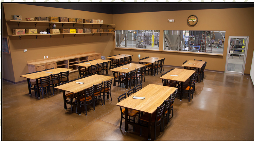
STANDARD ROOM LAYOUT

WITH A 32 FOOT PROJECTION SCREEN AND APPROXIMATELY 1,300 SQUARE FEET, OUR MEETING ROOM CAN HOLD 54 SEATED AND UP TO 100 PEOPLE RECEPTION STYLE. THE SPACE RENTS FOR $200 FOR THE FIRST 4 HOURS AND $100 FOR EACH ADDITIONAL HOUR.